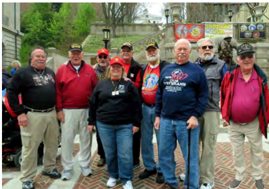
The Military Order of the World Wars gang