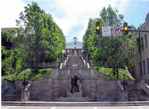
Monument Terrace, Lynchburg, Virginia