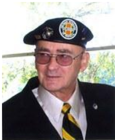
"Job well done, Brother"